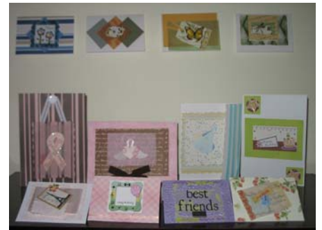
Scrap from the Heart cards & scrapbooks

You can contact Natasha directly at 603-205-5385 to place your order.